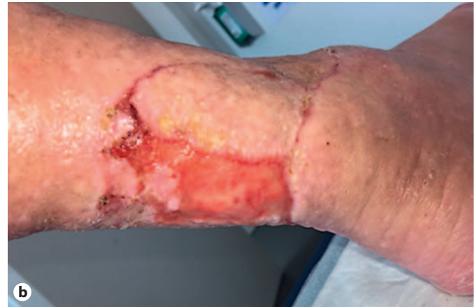
Fig. 2. A 90-year-old patient after excision of an ulcer hypertonicum Martorell and coverage with a split-skin mesh. a In due course, the formation of slightly bleeding, instable hypergranulations, which are possibly a sign of incipient infection. b After 2.5 weeks of daily dressing change and coverage with a Betadine gauze, the hypergranulations regressed and stable granulation tissue developed with a marked swelling of the wound vicinity.

The combination of PHMB/betaine was slightly less effective than NaOCl/HOCl against biofilm [132]. The speed of effect was superior to PVP-I, OCT, and PHMB [130, 133–137]. It can be assumed that the efficacy is reduced by protein or blood contamination, which can be reversed by repetitive extensive wound irrigation. The survival rate of rats with experimental peritonitis was significantly increased compared to a treatment with NaCl without undesirable effects [138]. By stabilization of the cell membrane, the release of cytokines from mast cells is